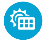
Off grid solar system